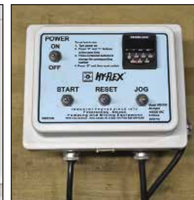
Electric water batch meter