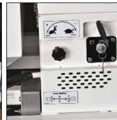
Simple, easy-to-use controls