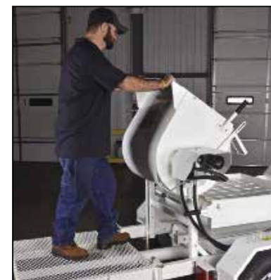
Easy dump mixer