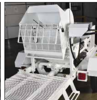
Backwards dumping mixer for quick cleanout