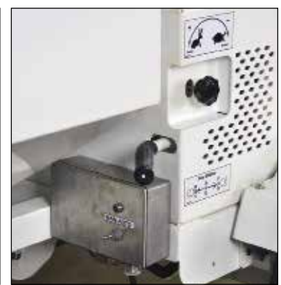
Simple, easy-to-use controls