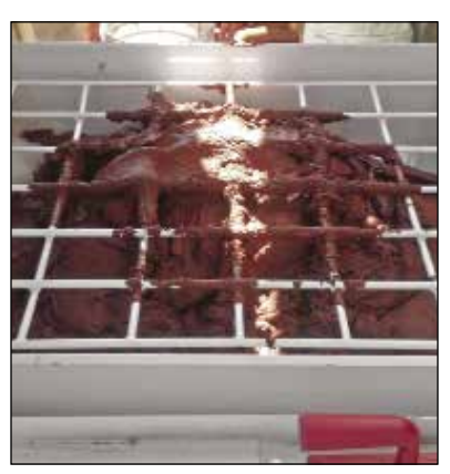
Easily pumps traditional stucco