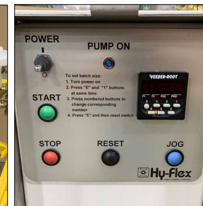
Easy to use controls & instructions