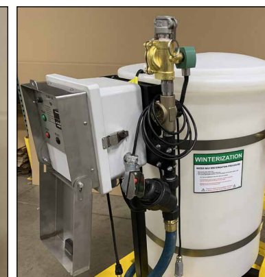
Securely mounted to cart