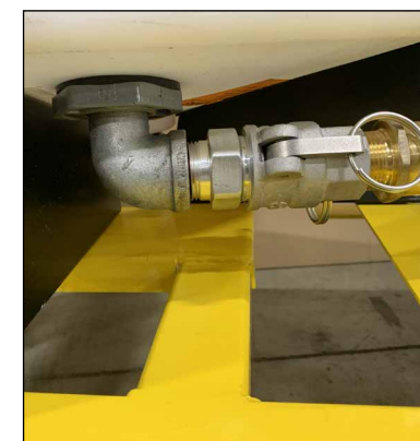
Easy tank cleanout and drain